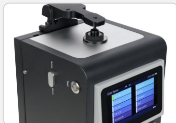
Horizontal or vertical measurement

Micro printer, foot switch, rotating bracket can be freely selected according to the needs.