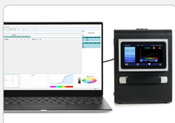
Color management software