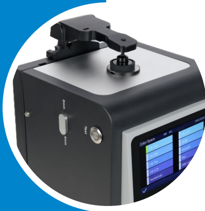
Horizontal or vertical measurement