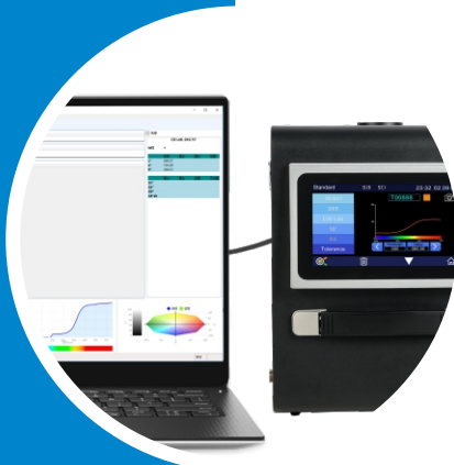
Color management software